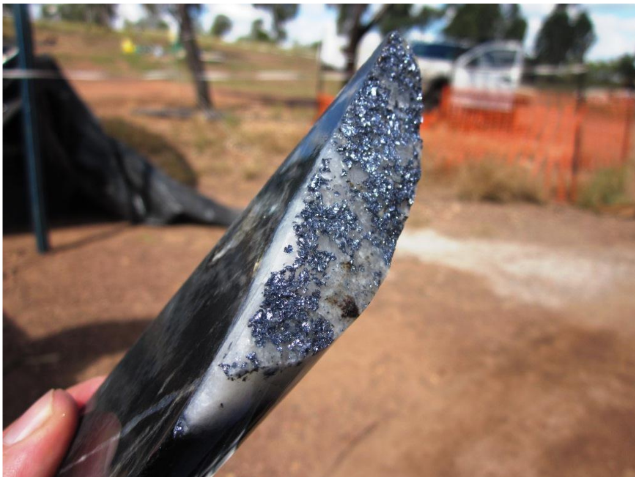
Coarse molybdenite at 295.95m depth in Hole RCD70

The Roskill Information Services Report 2010, notes at Table 12: “Resources of molybdenum by new project, 2009”, that most potential new open-cut molybdenum projects typically have grades less than 800 ppm Mo. Anthony would appear to compare favourably with these projects. Processing higher grade material results in lower capital and operating costs per unit of molybdenum output, thereby significantly improving the project returns.