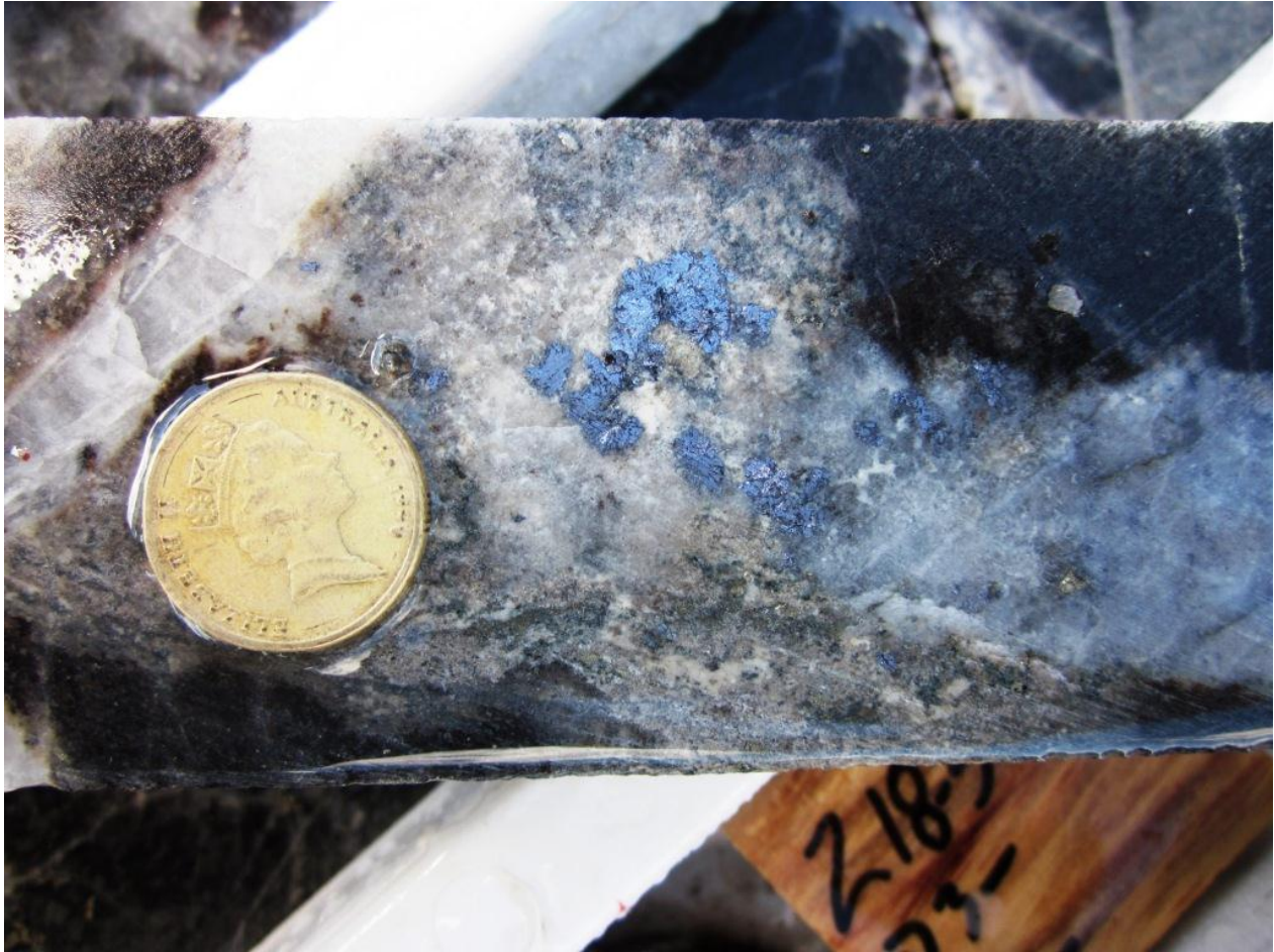
Coarse molybdenite at 218.6m depth in Hole RCD70 (with $2 coin)